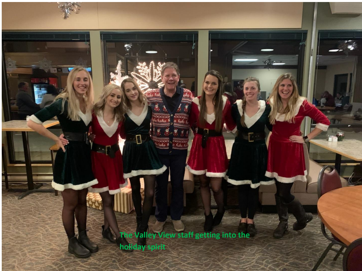
The Valley View staff getting into the holiday spirit