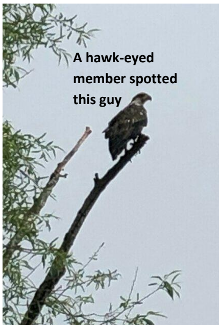
A hawk-eyed member spotted this guy