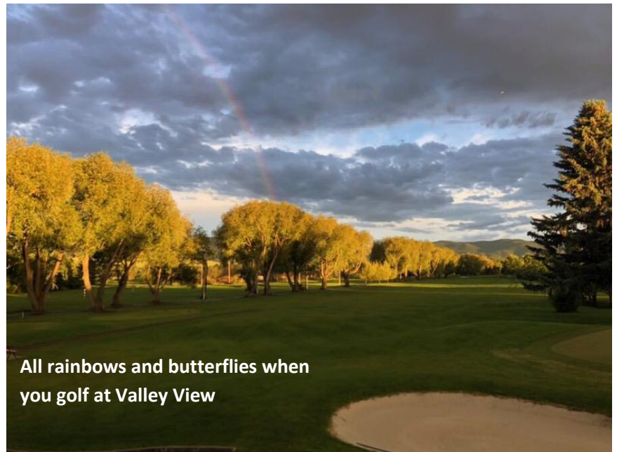
All rainbows and butterflies when you golf at Valley View